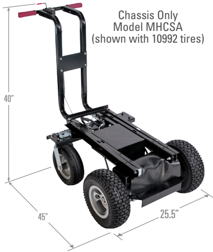
Chassis Only Model MHCSA (shown with 10992 tires)